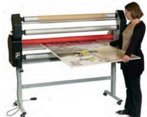
Collecting the mounted board !

With Starter, Kala illustrates that a modern production machine can be made in France with European components and parts, conforming to the latest Health, Safety and Electrical regulations and still be economical than machines coming from Far East.