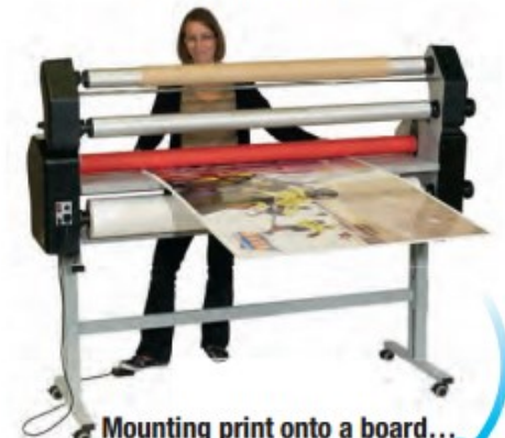
Mounting print onto a board...