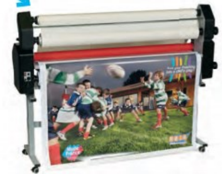
Laminated print !